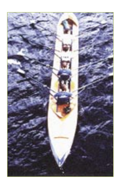
Tourboat from a CT River bridge.

Want to see more? Visit www.concept2.com/ F04update for more pictures and stories of the trip.