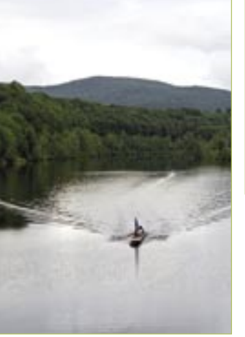
Another day on the river.