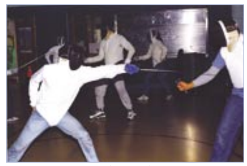
Norman's fencing class

"I teach fencing at a local high school, including adults. They often ask me what to do for general conditioning and I recommend the C2 Rower. It's a combination of things.