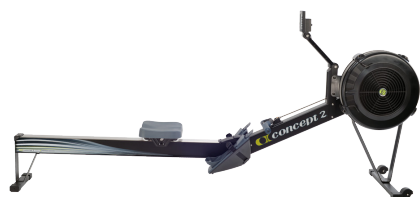
Model D (Shown in Black)

All prices are in GBP and include VAT. Postage and package is charged separately.